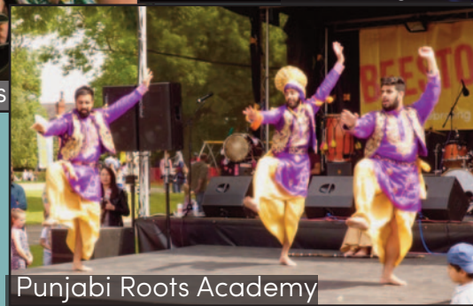
Punjabi Roots Academy