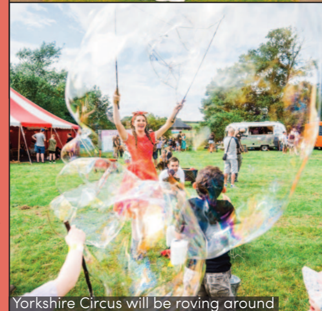
Yorkshire Circus will be roving around