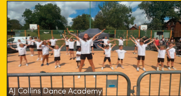
AJ Collins Dance Academy

Plus more to be announced Check the website for running order