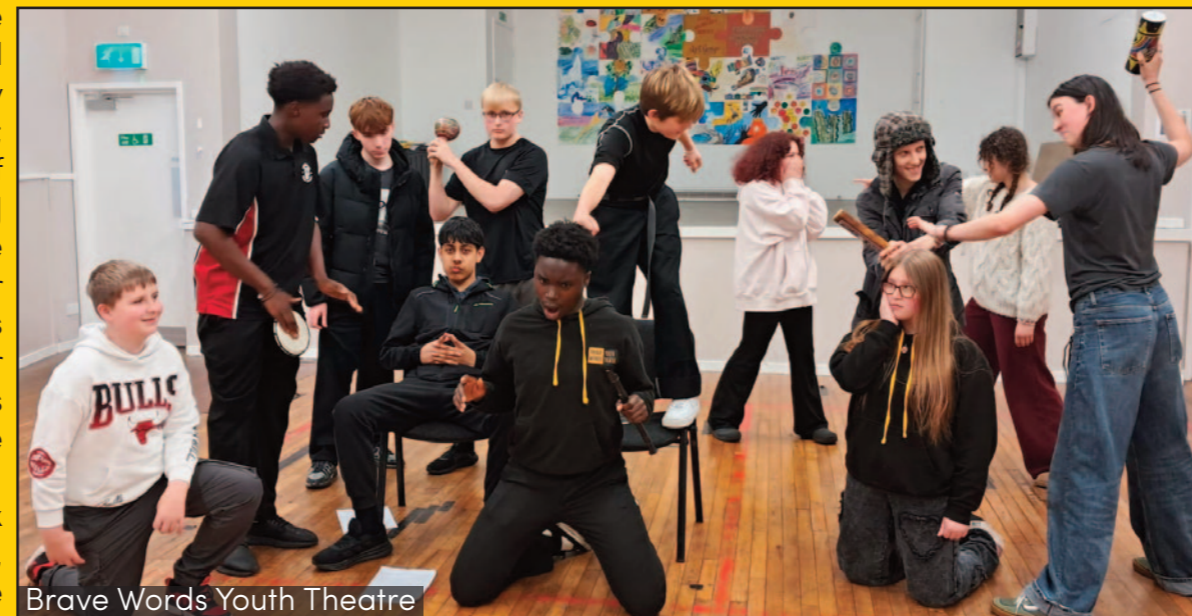
Brave Words Youth Theatre

The Big Bike Fix project will be on site, near the middle