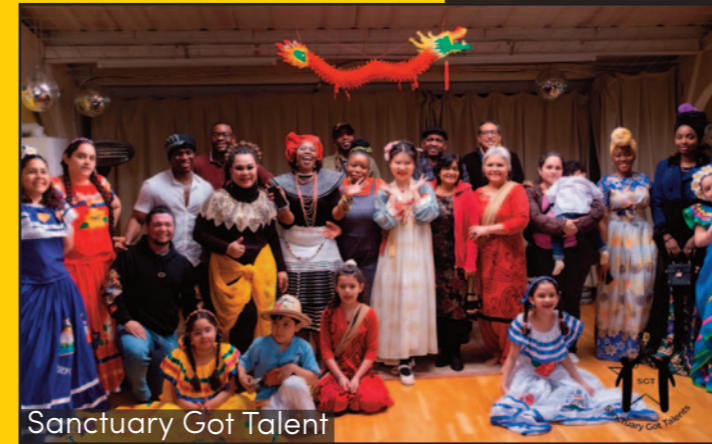
Sanctuary Got Talent